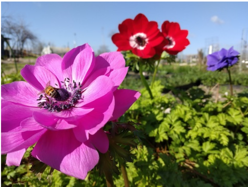
Poppies blooming on Valentine's Day (and found by a bee)