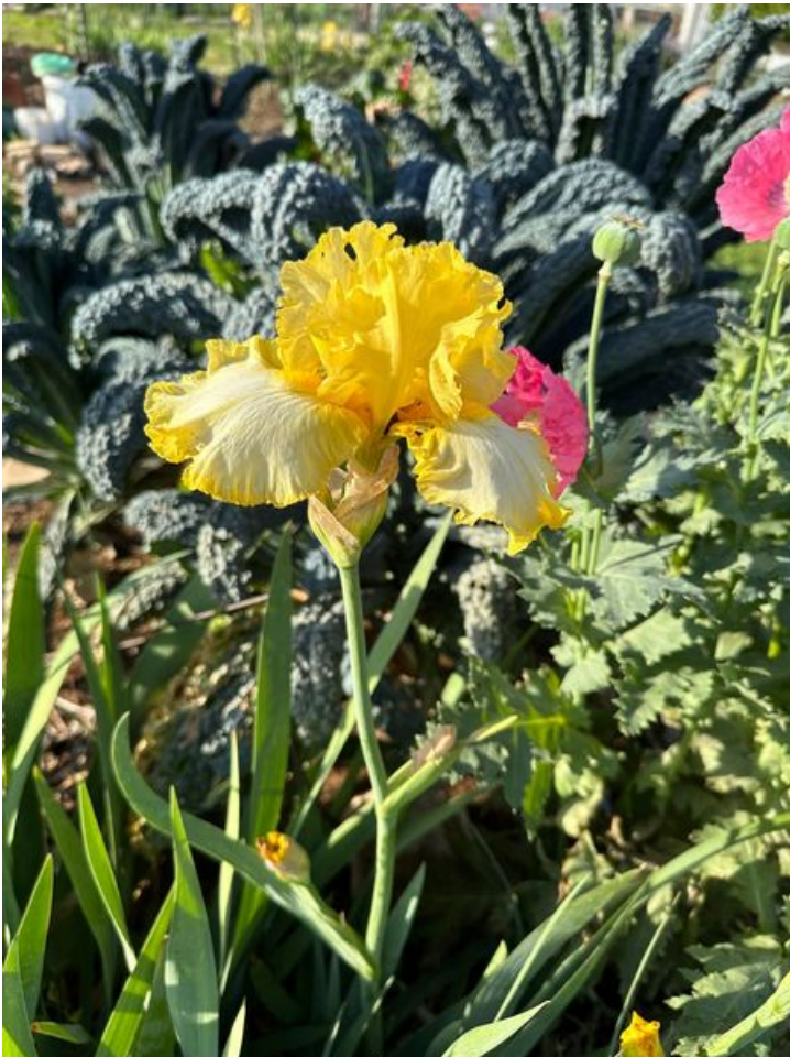
Iris by Iris (Slevin)